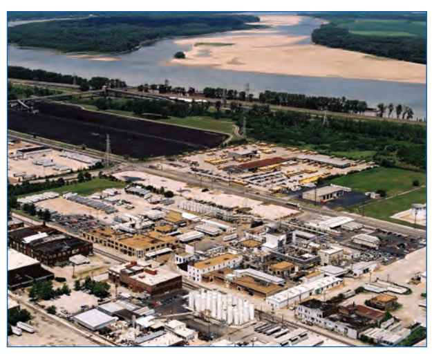
ELANTAS PDG, Inc. headquarters in St. Louis, Missouri

ELANTAS Electrical Insulation companies are strategically located throughout the world to meet the primary insulation, secondary insulation and electronic and engineering materials needs of our customers.