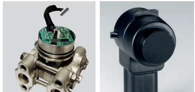
Potting & Encapsulation