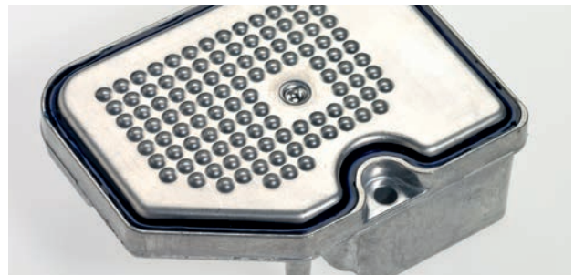
Sealing & Adhesion